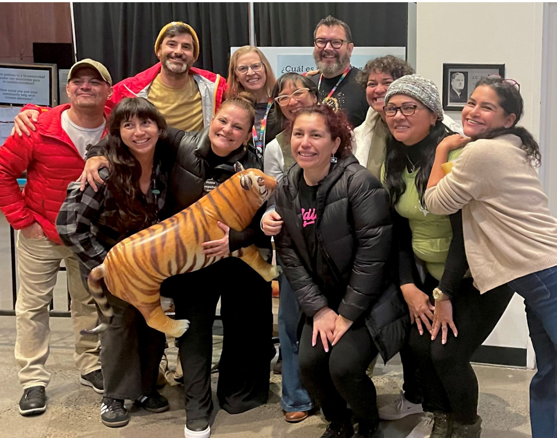
Team members at Family Science Night, Nov. 12, 2024