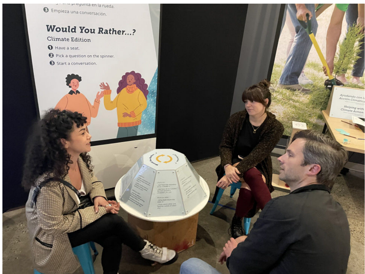
Exhibit prototype of the “Would You Rather...” conversation game

Project reports and resources available January 2026 https://omsi.edu/for-museum-professionals/voces/