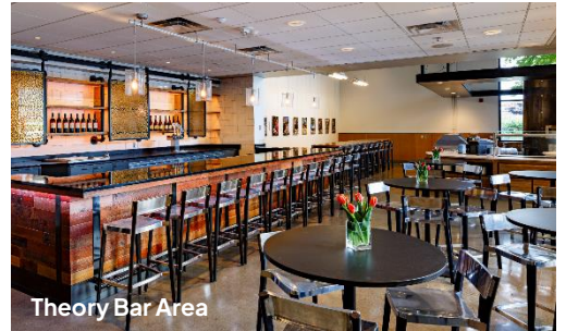
Theory Bar Area