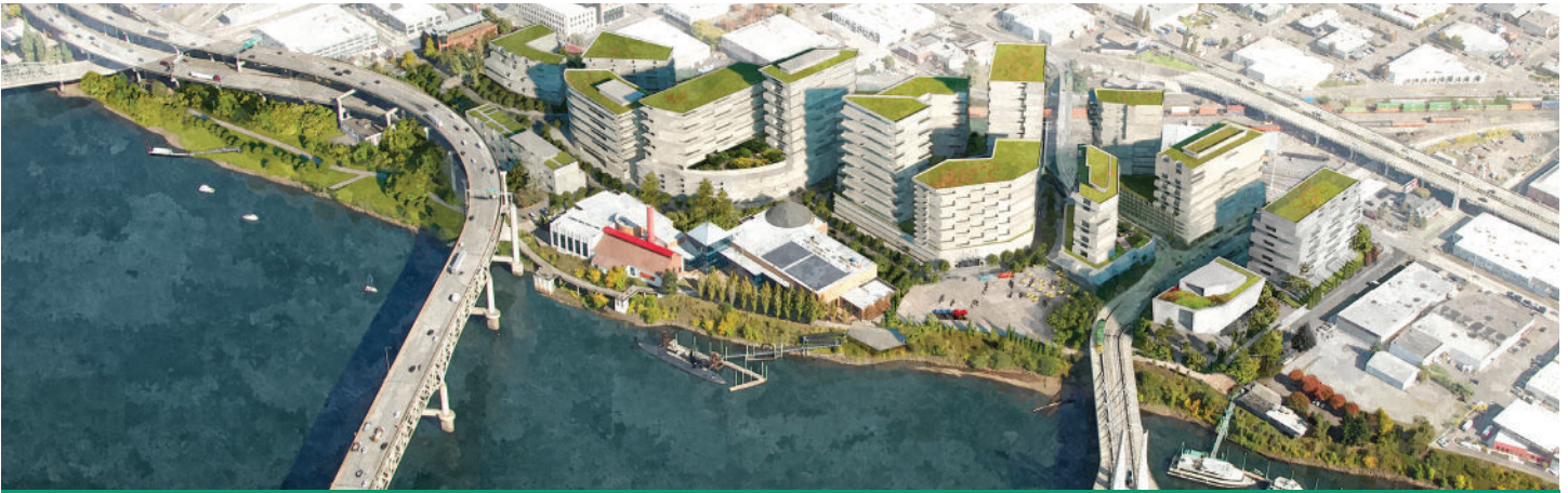
PROPOSED OMSI DISTRICT RENDERING