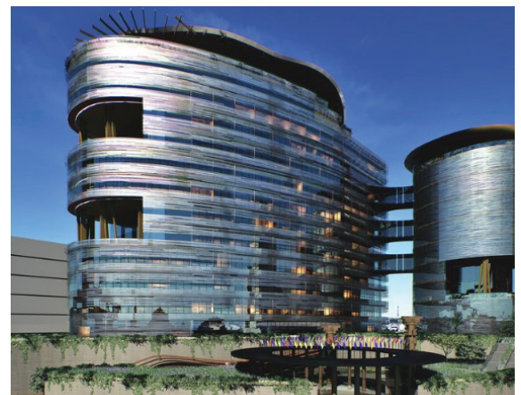
PROPOSED CENTER FOR TRIBAL NATIONS