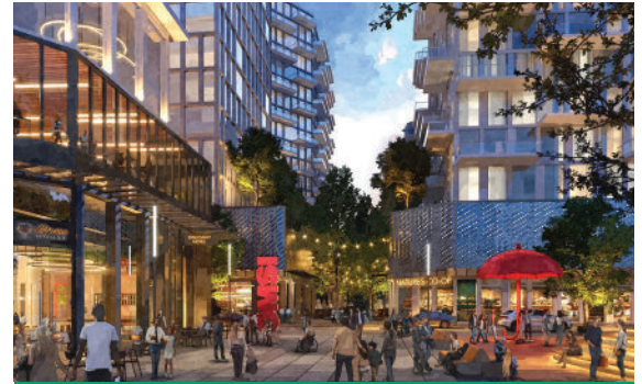
PROPOSED OMSI DISTRICT

The OMSI District will be an inclusive, vibrant new neighborhood and community destination rooted in innovation, culture, arts, and science learning in Portland's Central City. It will restore Tribal presence on the Willamette River through a Center for Tribal Nations and a new waterfront education park . Encompassing 24 acres of transit-oriented, mixed-use development, 1,200 units of new market rate and affordable housing, 11,000+ new jobs, climate and sustainability solutions, and a one-of-a-kind public learning ecosystem , the OMSI District serve as a platform for innovation, spreading opportunities throughout the state and the region.