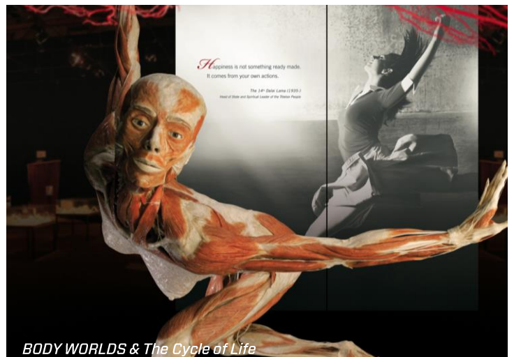
BODY WORLDS & The Cycle of Life

Book your event today at eventsales@omsi.edu | omsi.edu/private-events